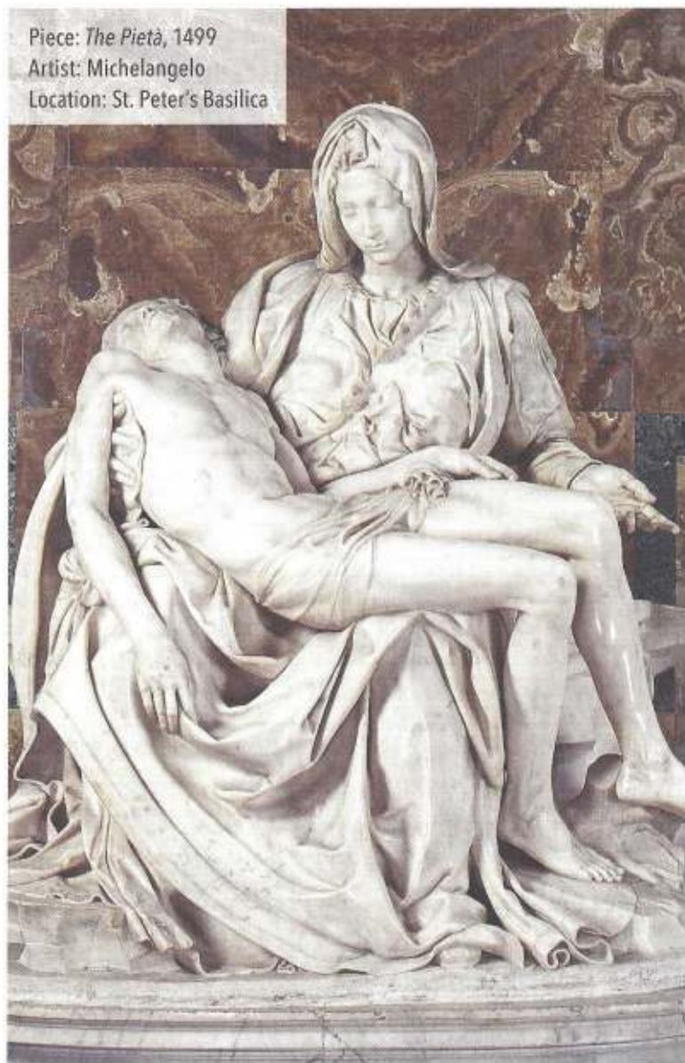
Piece: The Pietà , 1499 Artist: Michelangelo Location: St. Peter's Basilica