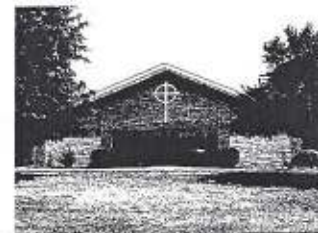
Holy Trinity - Cherry