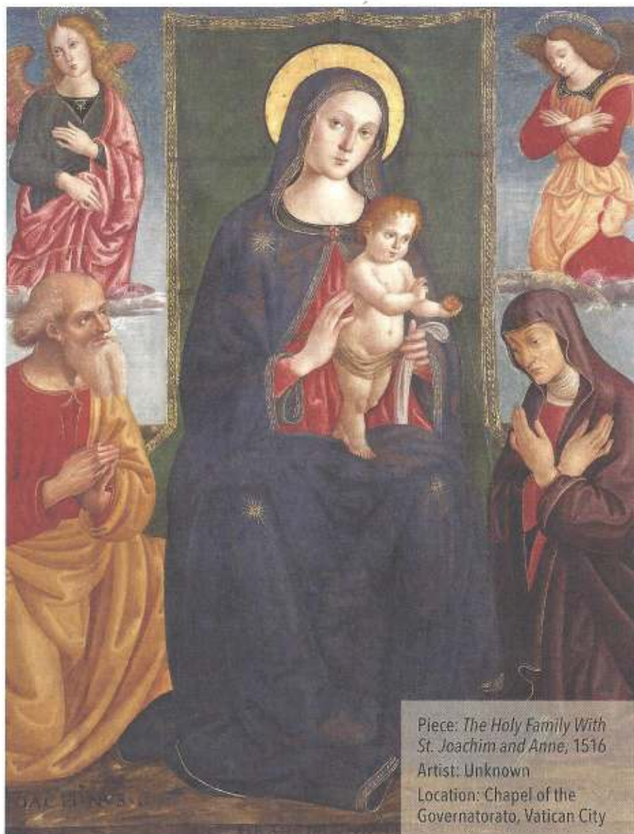
Piece: The Holy Family With St. Joachim and Anne , 1516 Artist: Unknown Location: Chapel of the Governatorato, Vatican City