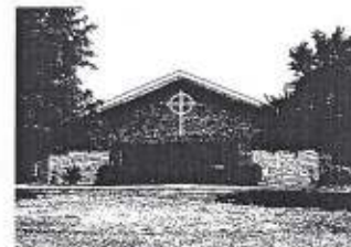
St. Thomas More - Dalzell

The Main Office Of Holy Trinity & St. Patrick Catholic Church Is Located At: