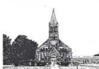
St. Patrick - Arlington