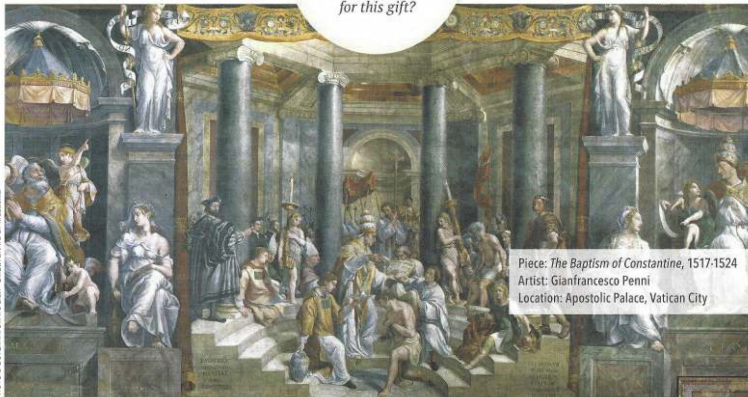
Piece: The Baptism of Constantine , 1517-1524

In baptism I became a child of God. Do I give thanks enough for this gift?