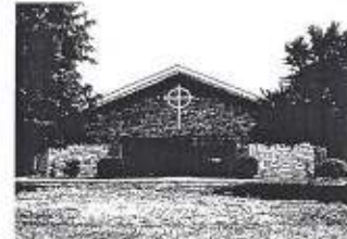
Holy Trinity - Cherry