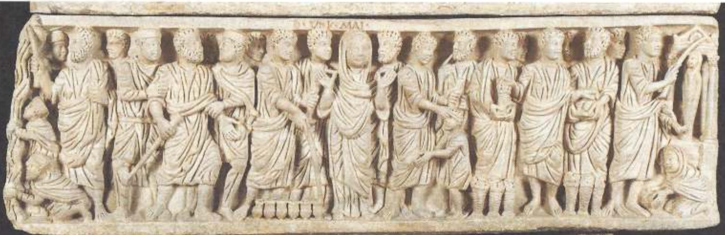
Piece: Sarcophagus, Plus-Christian collection, Third century Artist: Unknown Location: Vatican Museums

Am I generous with my time, treasure, and talent? Do I multiply what I have by giving it to God and others, allowing him to return it to me twelvefold?