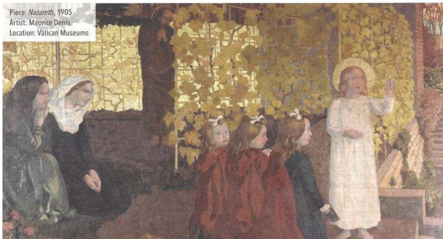
Piece: Nazareth , 1905 Artist: Maurice Denis Location: Vatican Museums

Is he not the carpenter, the son of Mary?...He was amazed at their lack of faith.