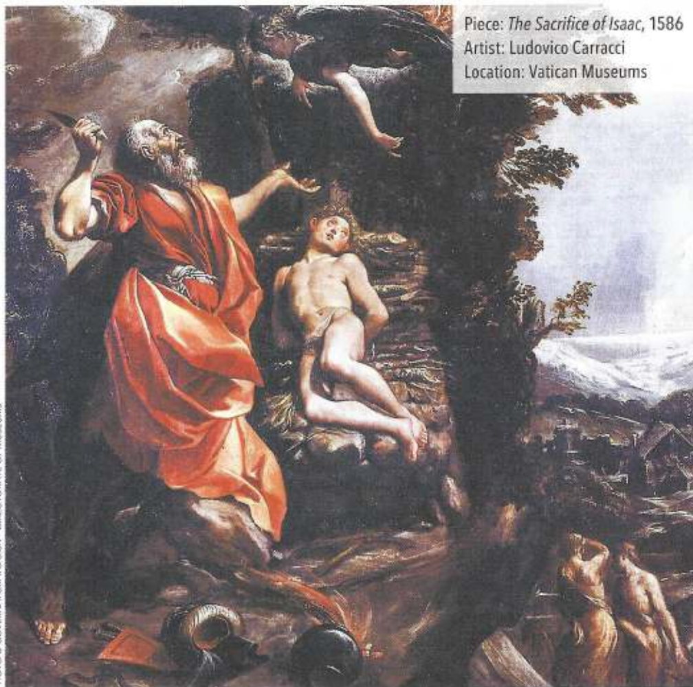
Piece: The Sacrifice of Isaac , 1586 Artist: Ludovico Carracci Location: Vatican Museums