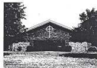
Holy Trinity - Cherry