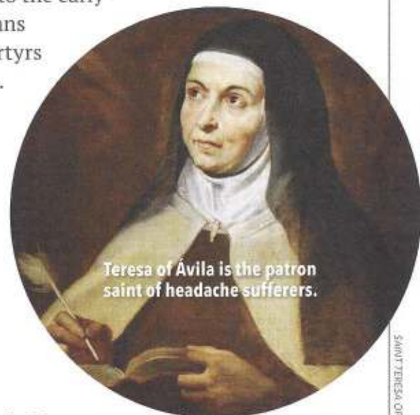
Teresa of Avila is the patron saint of headache sufferers.

From Dear Padre: Questions Catholics Ask , © 2003 Liguori Publications