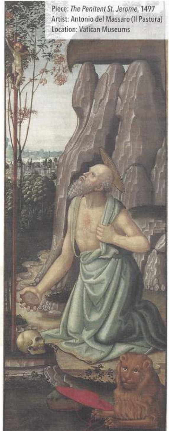
Piece: The Penitent St. Jerome , 1497 Artist: Antonio del Massaro (Il Pastura) Location: Vatican Museums

[Jesus said,] "You are looking for me not because you saw signs but because you ate the loaves and were filled."