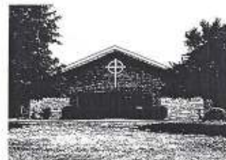
Holy Trinity - Cherry