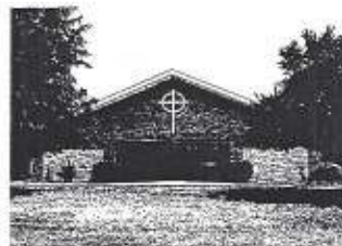
Holy Trinity - Cherry