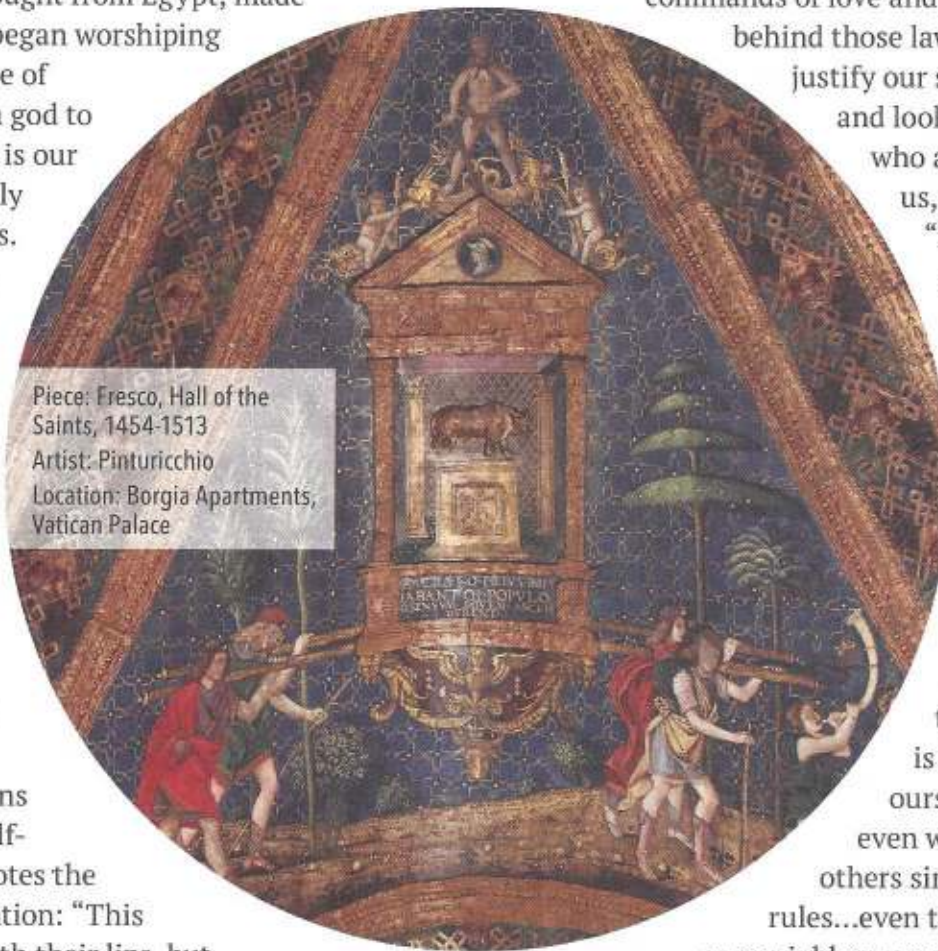
Piece: Fresco, Hall of the Saints, 1454-1513 Artist: Pinturicchio Location: Borgia Apartments, Vatican Palace