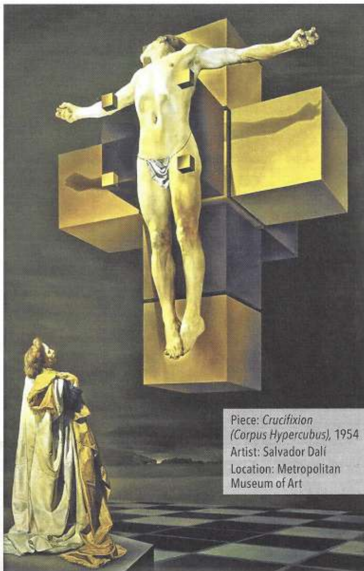
Piece: Crucifixion (Corpus Hypercubus) , 1954 Artist: Salvador Dalí Location: Metropolitan Museum of Art

How have you followed them? Should you get back to them?