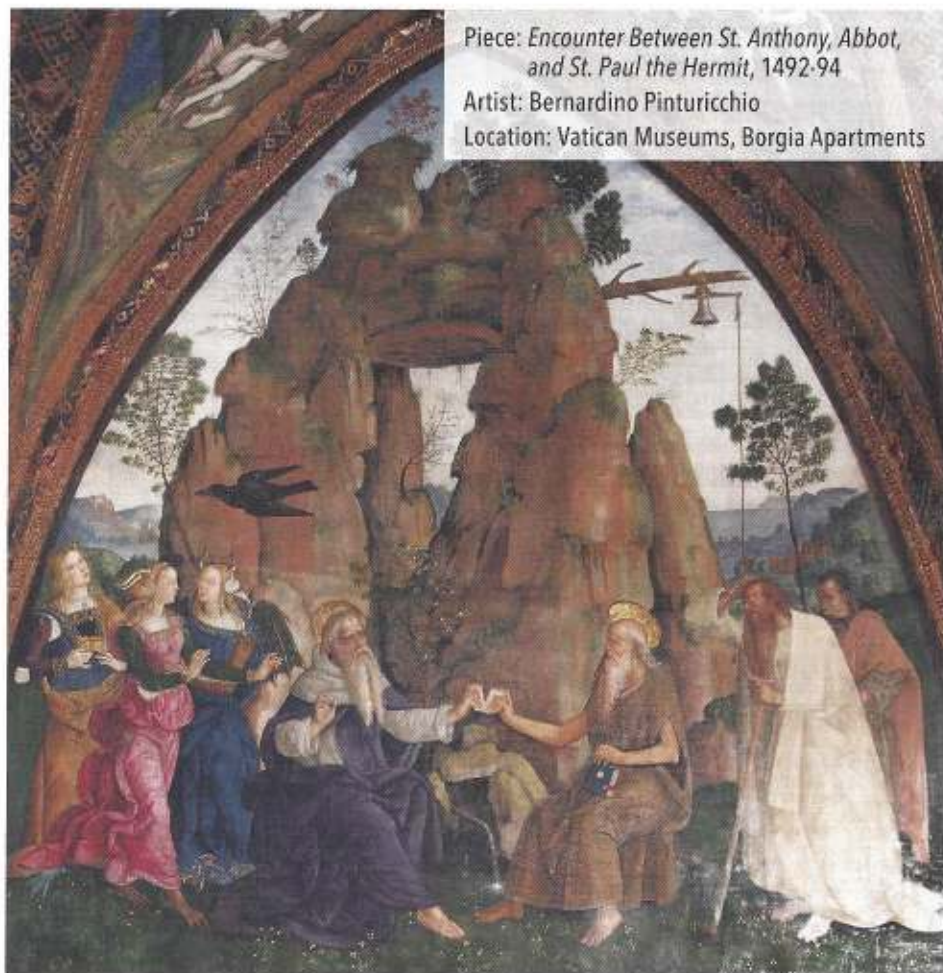
Piece: Encounter Between St. Anthony, Abbot, and St. Paul the Hermit , 1492-94

Religious brothers and sisters living by the vows of poverty, chastity, and obedience—as monks, hermits,