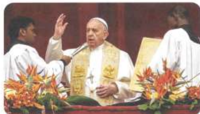
CATHOLIC NEWS AGENCY

Go to DearPadre.org to send your question and to learn more about Dear Padre .