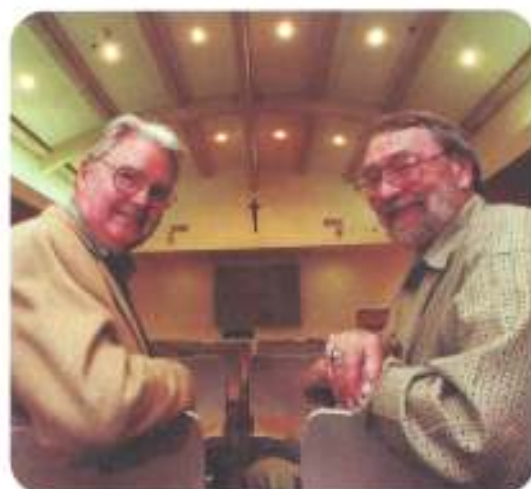
A candidate and his sponsor sit for a photo after an Order of Christian Initiation for Adults (OCIA) class.

I am happy you have responded to the stirrings of the Holy Spirit within you and answered the call to deepen your spiritual practice and journey. The Church needs you. The people of God welcome you. You are beloved among us, and your response in faith is a powerful witness, a reminder to those who may be tempted to take for granted the gift of faith. Thank you. ●