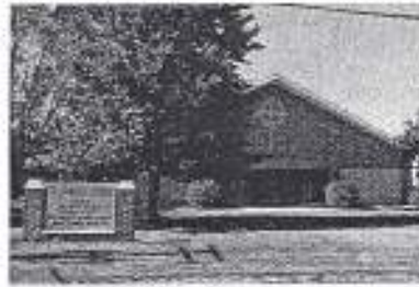
St. Thomas More

Office Hours Tuesday - Friday 9 am - 1 pm