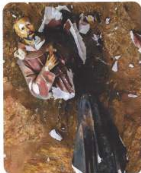
TACD PHILIP SANSONOWSKI / SHUTTERSTOCK