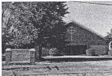
St. Thomas More Catholic Church