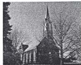
St. Patrick Catholic Church