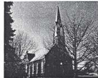
St. Patrick Catholic Church