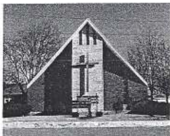
Holy Trinity Catholic Church