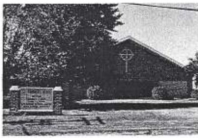
St. Thomas More Catholic Church