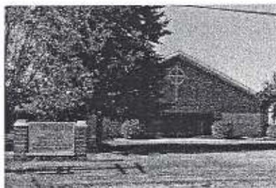
St. Thomas More Catholic Church