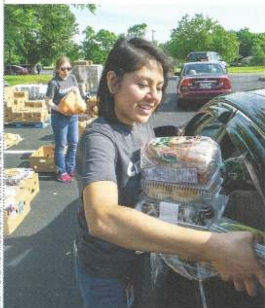
In the poor, Jesus is with us. Here, volunteers work at a food pantry in Nashville.