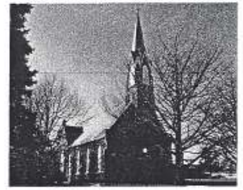
St. Patrick Catholic Church