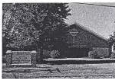
St. Thomas More