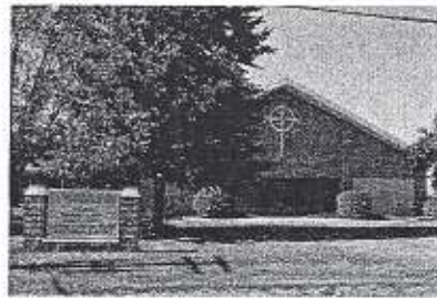
St. Thomas More Catholic Church