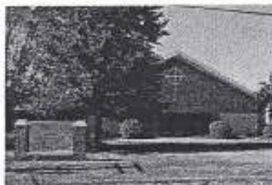
St. Thomas More