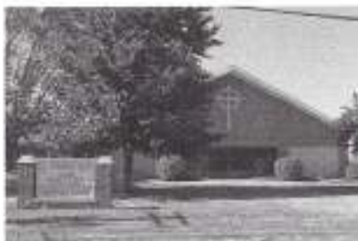
St. Thomas More

Office Hours Tuesday - Friday 9 am - 1 pm