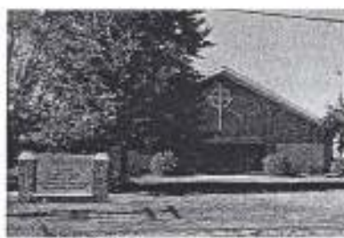
St. Thomas More