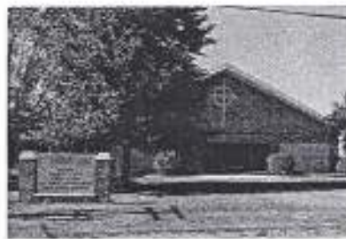
St. Thomas More Catholic Church