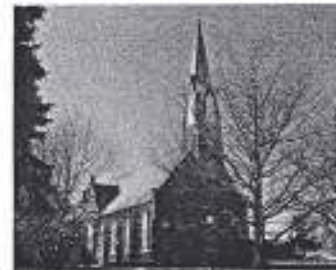
St. Patrick Catholic Church