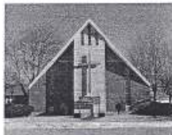
Holy Trinity Catholic Church