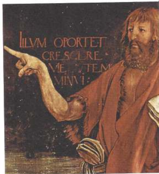
NICOLAUS OF HAGUENAU AND MATTHIAS GROENEWALD: JOHN THE BAPTIST, DETAIL OF THE ISENHEIM ALTARPIECE