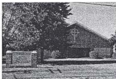
St. Thomas More Catholic Church