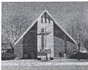
Holy Trinity Catholic Church