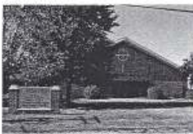
St. Thomas More