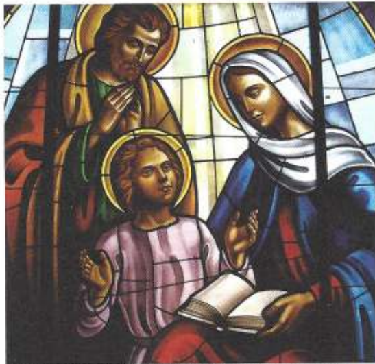
HOLY FAMILY / IMMACULATE CONCEPTION CATHEDRAL, EAST TIMOR