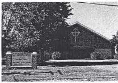
St. Thomas More Catholic Church