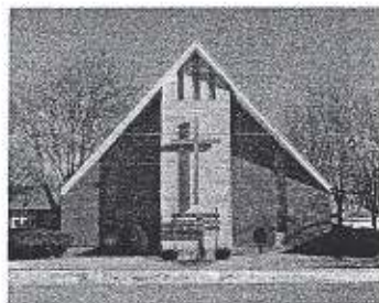
Holy Trinity Catholic Church