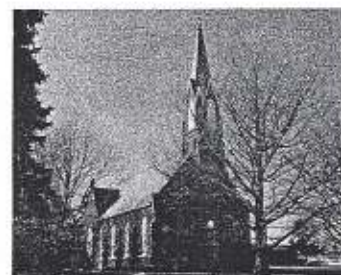
St. Patrick Catholic Church