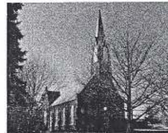
St. Patrick Catholic Church