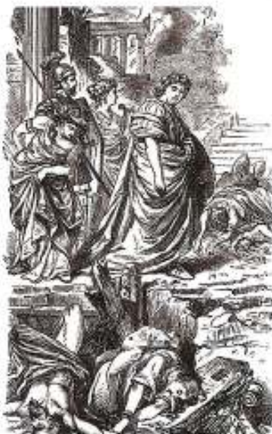
ROMAN EMPIRE: NERO, LEFT

Instead of worrying about the end of time, an Antichrist, a final battle, and "evil" numbers, Catholics are encouraged to believe that Christ has already conquered sin, death, and Satan. God's reign is already here in our midst (see Luke 17:20-21). Our task is to prepare for our own moment of dying and meeting the Lord. We leave the rest to God's providence!