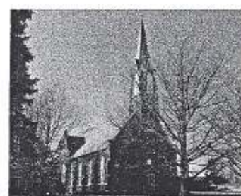
St. Patrick Catholic Church