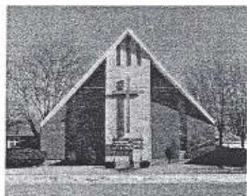
Holy Trinity Catholic Church