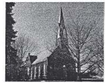
St. Patrick Catholic Church