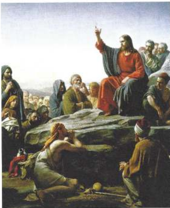
SERMON ON THE MOUNT BY CARL BLOCH/AMSTERDAM