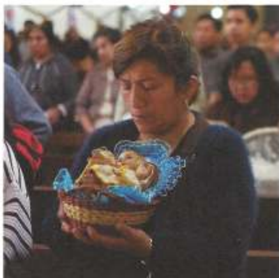
A woman holds a figurine of the Christ Child during Mass on the feast of the Epiphany.

Epiphany, on the other hand, is made for celebration, gift-giving, going all out. Perhaps someday we can return to the traditions of Epiphany and restore Christmas as a day of rejoicing and worship.