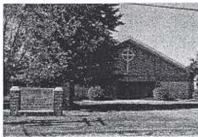
St. Thomas More Catholic Church