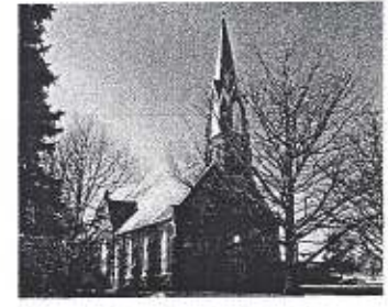
St. Patrick Catholic Church