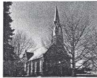
St. Patrick Catholic Church