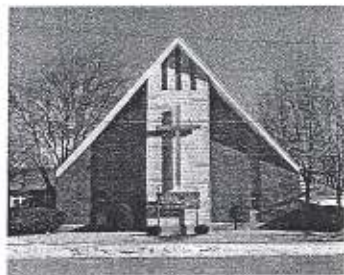
Holy Trinity Catholic Church