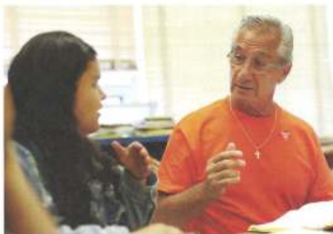
ONS PHOTOGRAPHY & SHOOTING

Most Catholic parishes need a faith-formation program for adults who want to take their faith to a deeper level. If yours doesn't offer adult-education programs, many publishers offer programs that can be used for individual study. Let your own interest and curiosity be your guide.