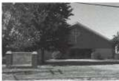
St. Thomas More Catholic Church