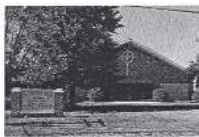
St. Thomas More