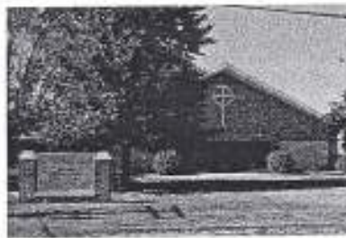
St. Thomas More