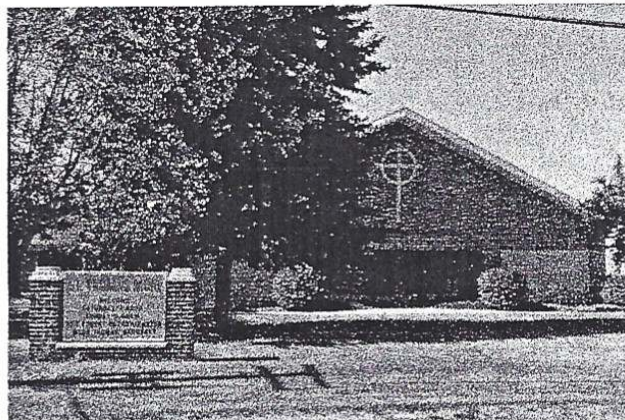
St. Thomas More Catholic Church