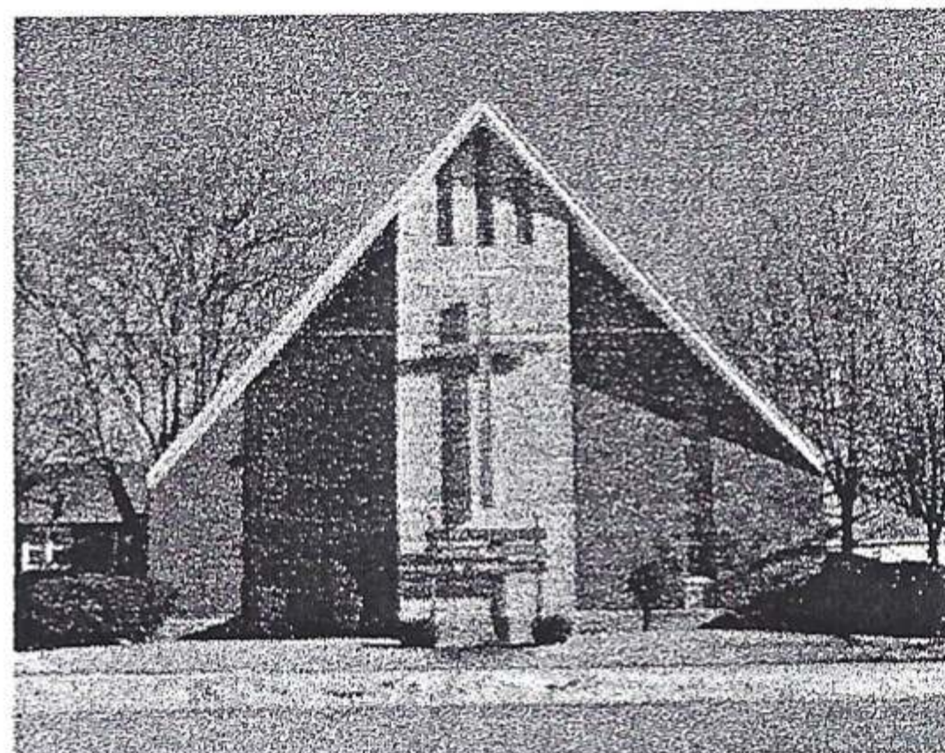
Holy Trinity Catholic Church