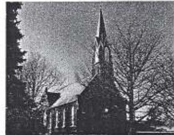
St. Patrick Catholic Church