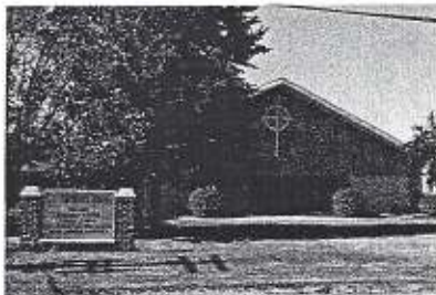
St. Thomas More Catholic Church