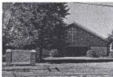
St. Thomas More