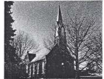
St. Patrick Catholic Church